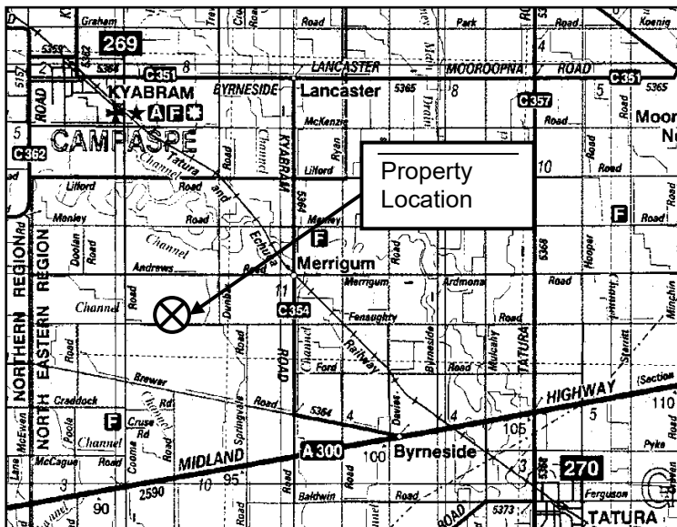
Regional Locality Plan

Can be a copy of VicRoads Directory or CFA map.